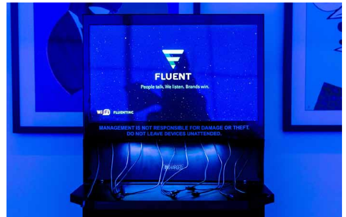
PHOTO BOOTH SPONSOR